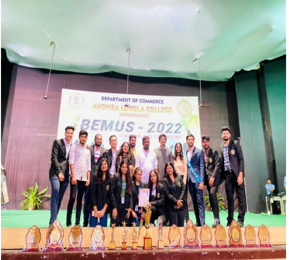
2<sup>nd</sup> Prize for Feel the Rhythm at BEMUS 2022 Overall Championship Award at BEMUS 2022