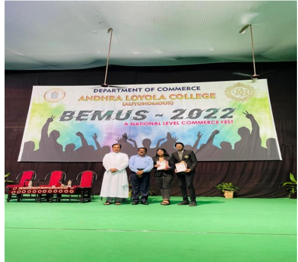
1st Prize for Business Plan at BEMUS 22