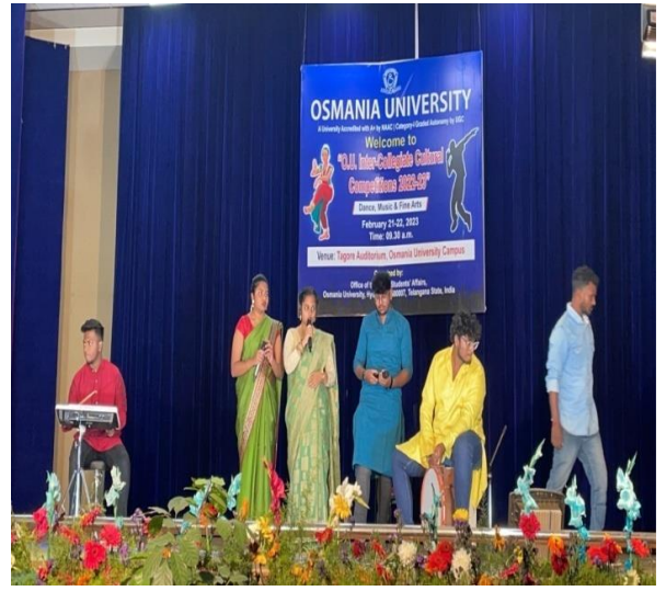
2<sup>nd</sup> Prize - Group Song (Indian)