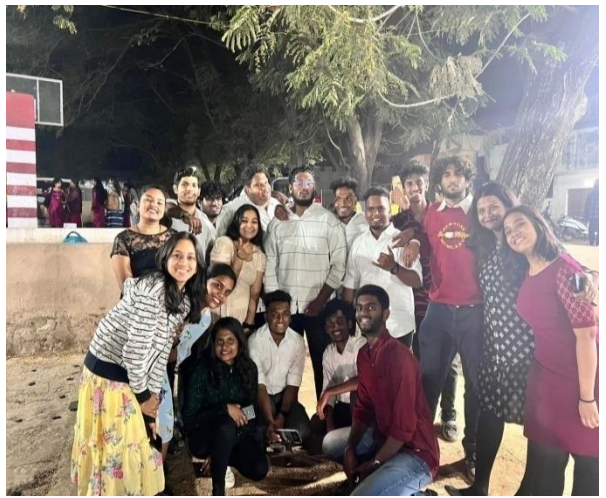
2<sup>nd</sup> Prize - Carol Singing, St.Ann's College