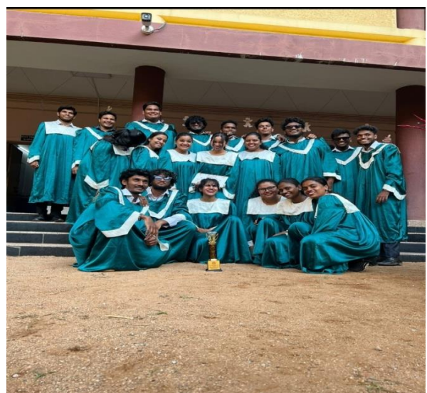
2<sup>nd</sup> Prize – Carol Singing, Little Flower School