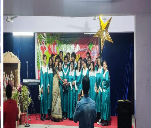
3<sup>rd</sup> Prize - Carol Singing, Holy Family Church 2<sup>nd</sup> Prize - United Christmas Celebrations