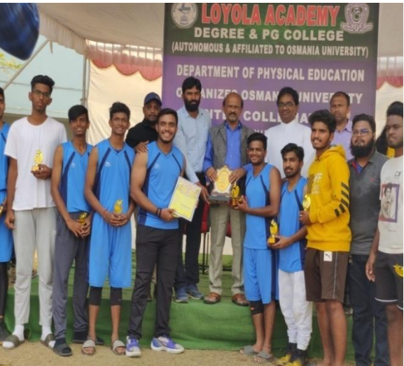
3^{\rm rd} Prize - Inter Collegiate Basketball Tournament