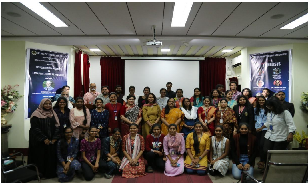
The Dept. of English and Mass Communication and Journalism with the resource persons and participants of the Symposium