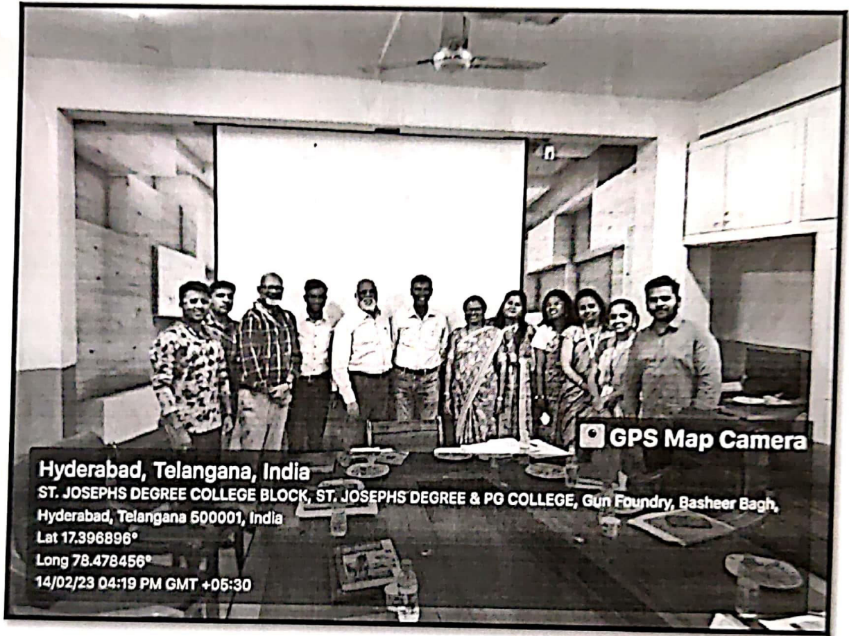
Group photo of the Industry experts with the faculty of the Mass Communication Department

The outcome of the event – The suggestions put forward by the subject experts were taken into consideration, also necessary changes will be made henceforth in the syllabus which would help the students be in tune with the changing industry needs.