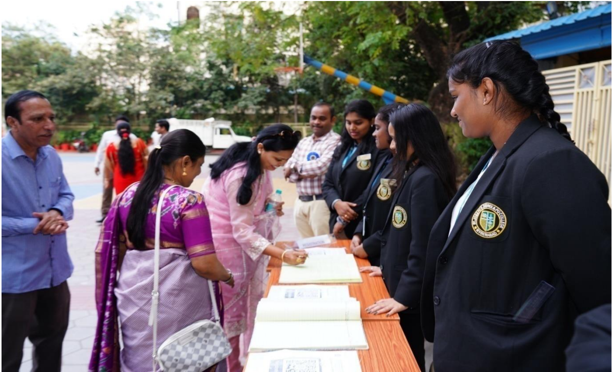
Alumni Registering for MILAN 2024