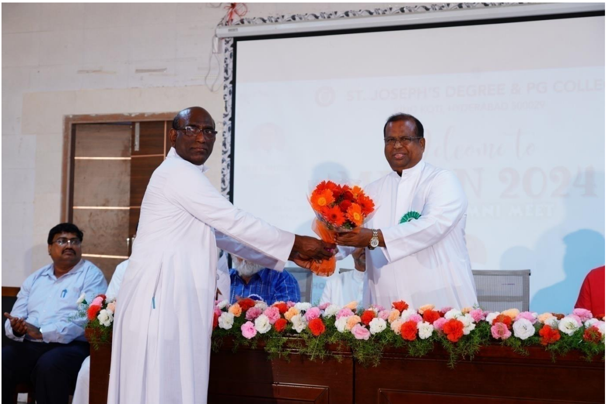
Welcoming Chief Guest