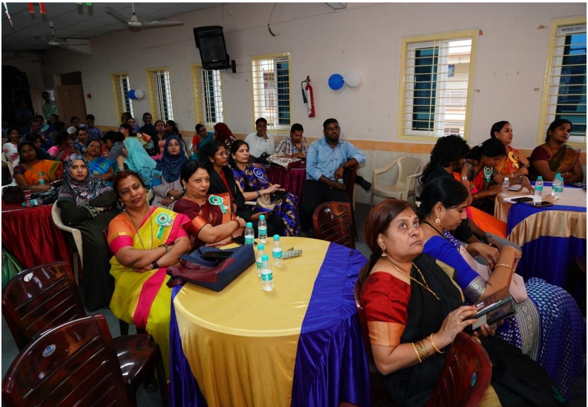
Faculty attending MILAN 2024