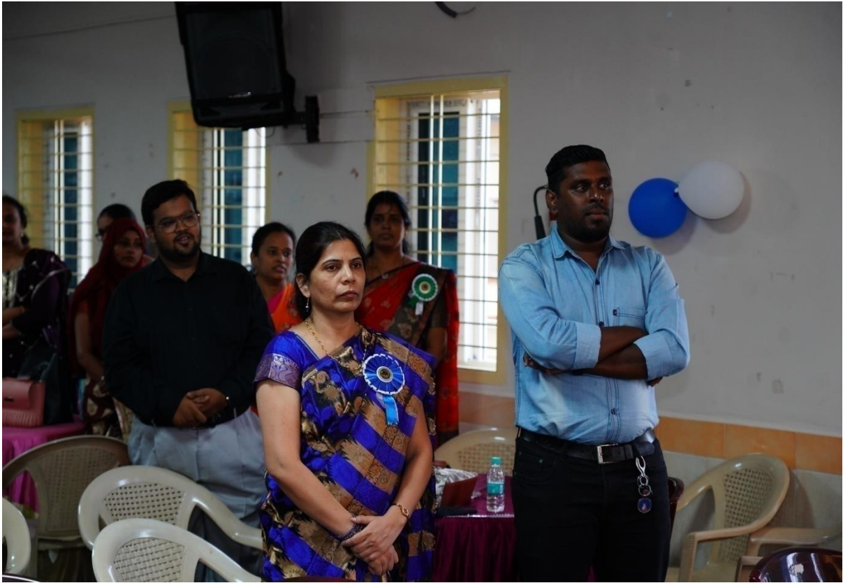
Prayer Song by College Choir “Anna Domini”