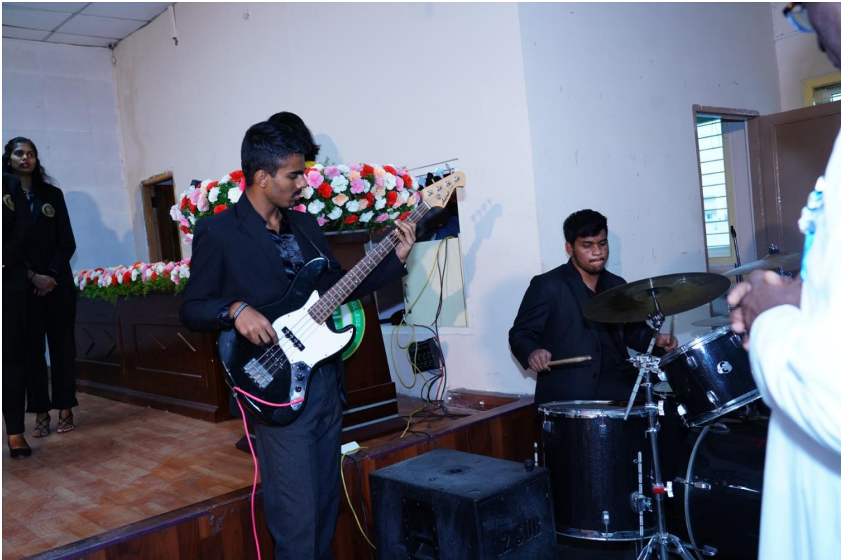
Prayer Song by College Choir "Anna Domini"