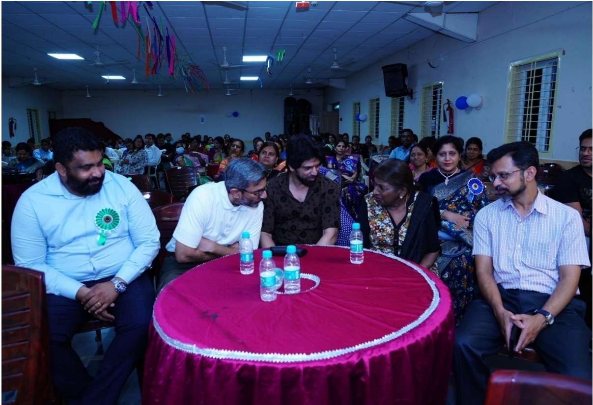
Alumni interacting with Faculty