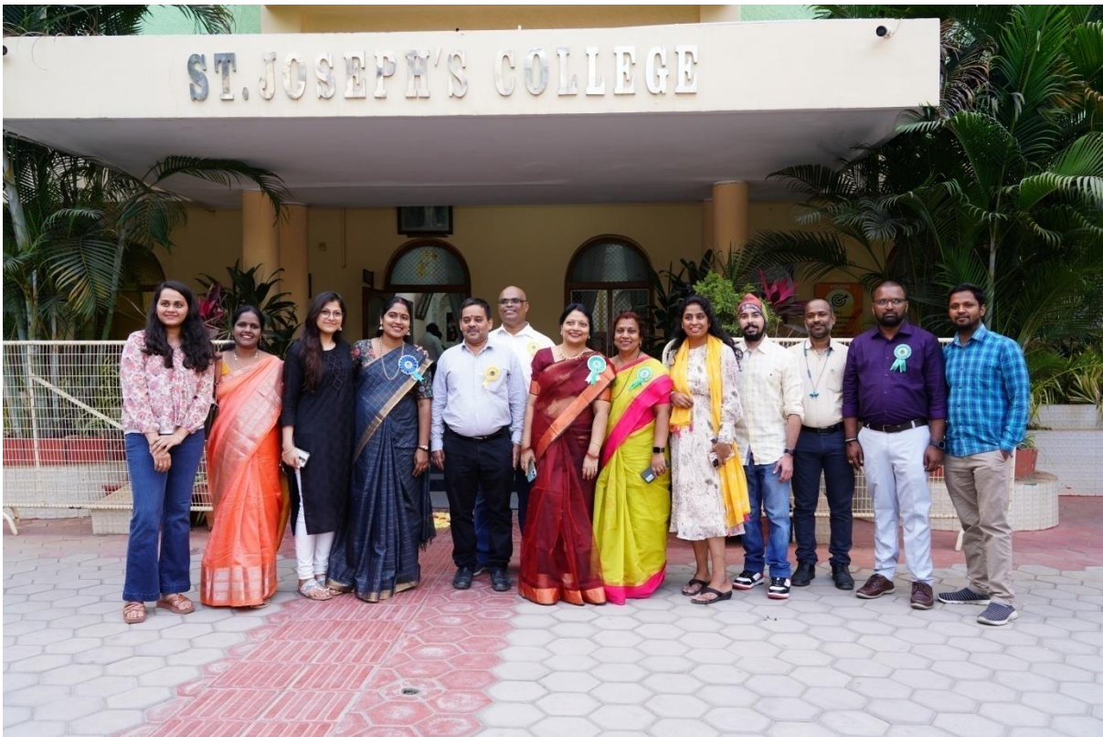
Alumni with Faculty