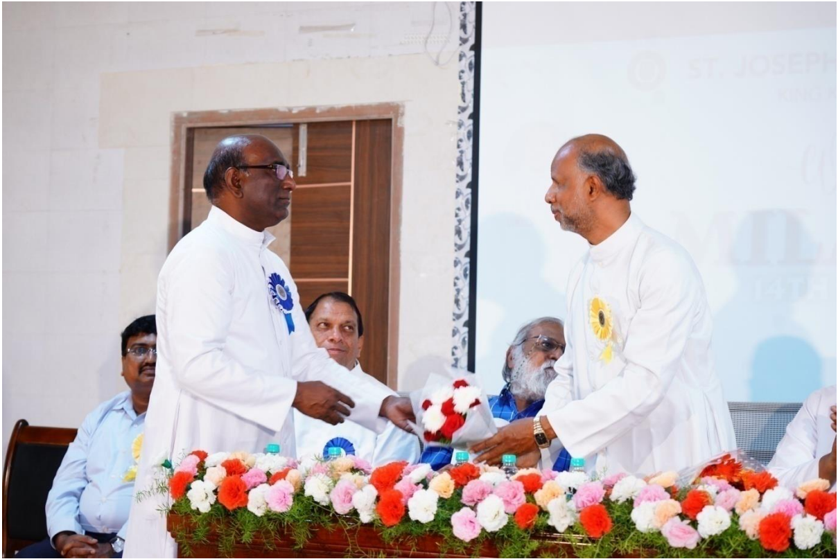
Welcoming Guest of Honour