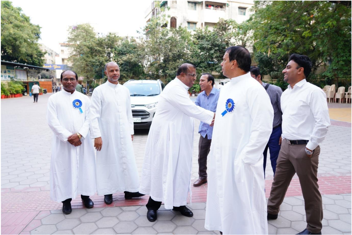
Welcoming of Dignitaries for “MILAN 2024”