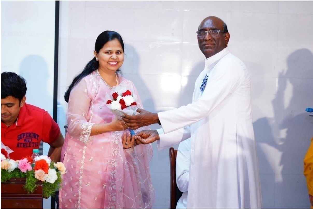
Welcoming Guest of Honour