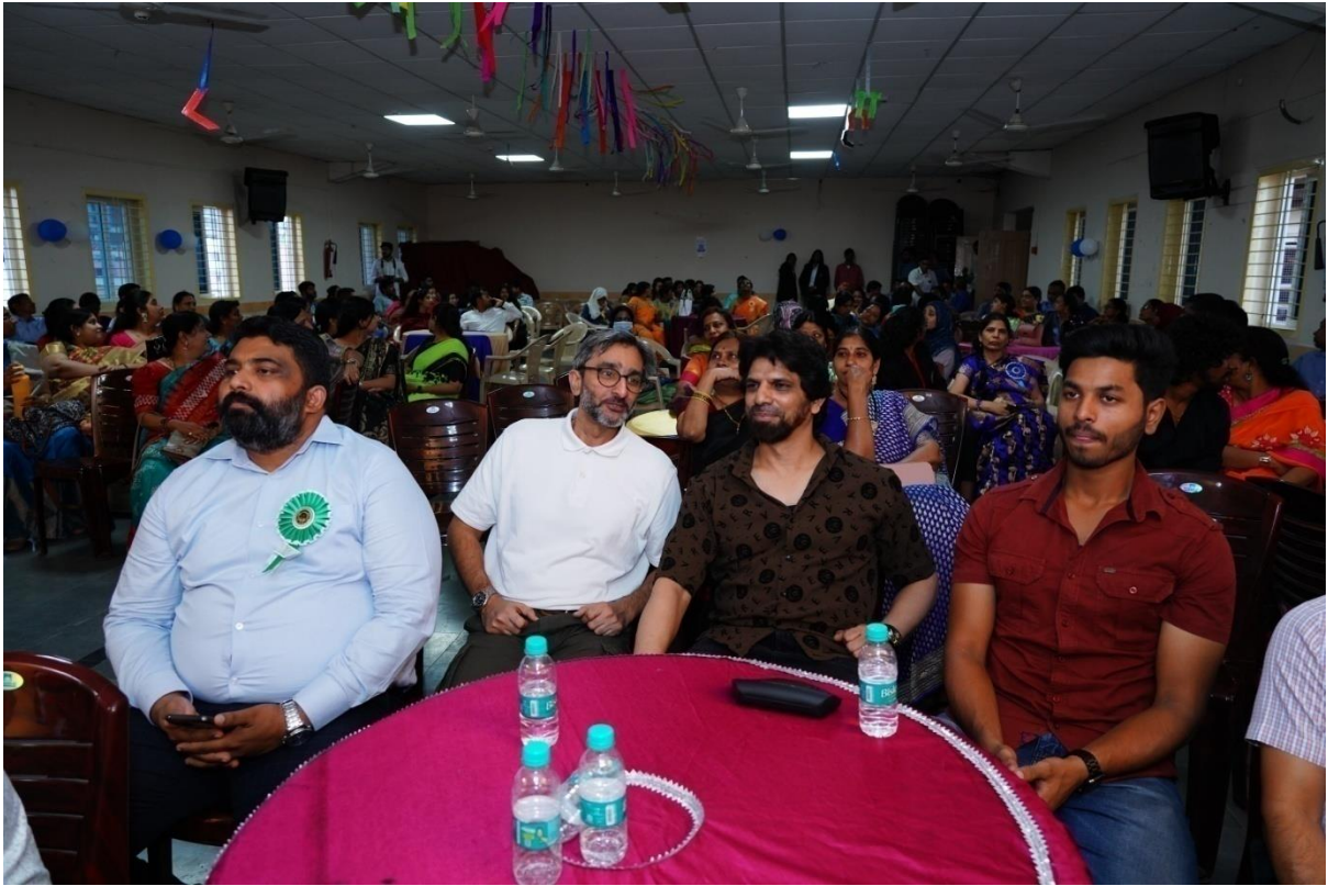
Alumni attending MILAN 2024