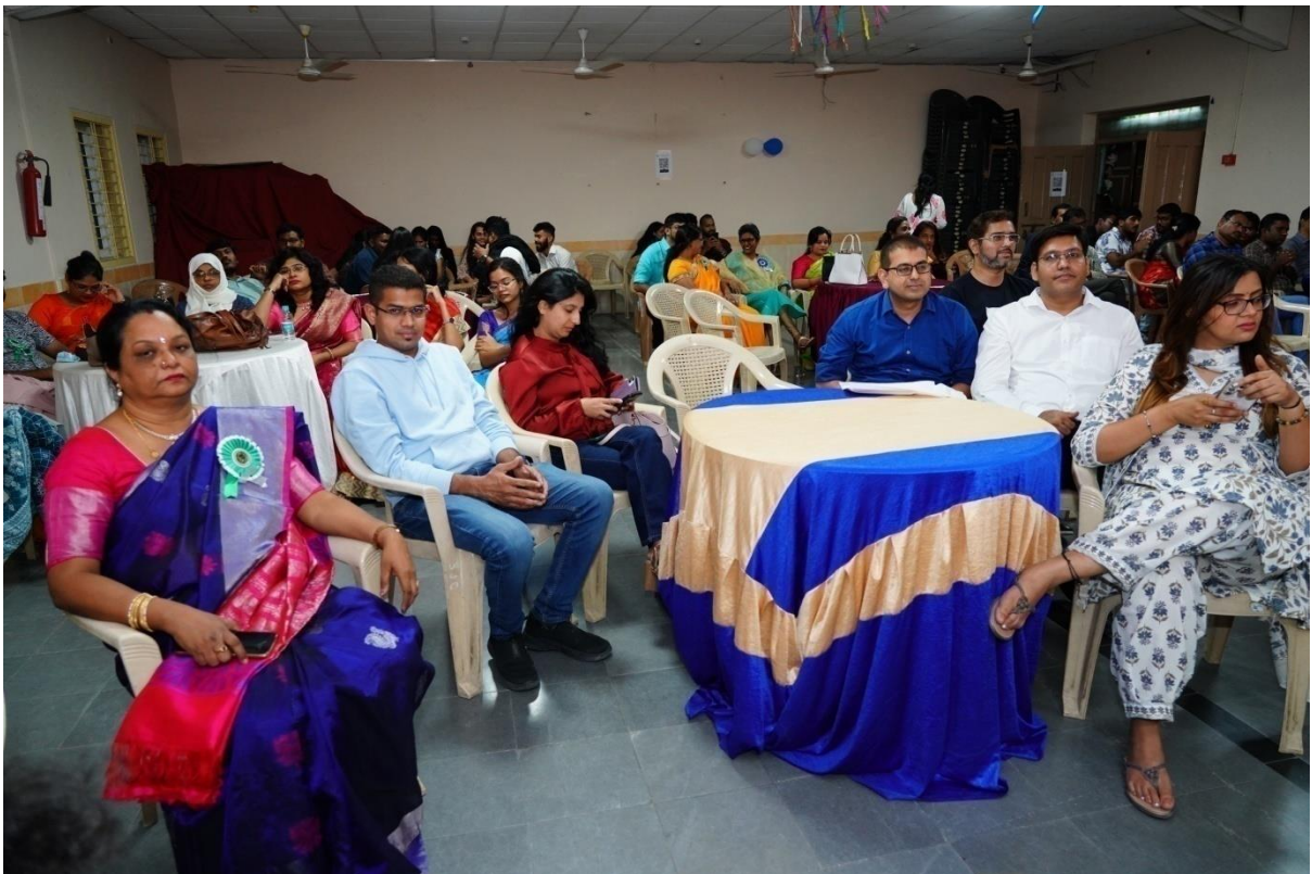
Alumni attending MILAN 2024