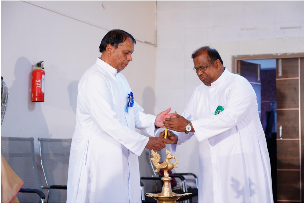
Lighting of the Lamp