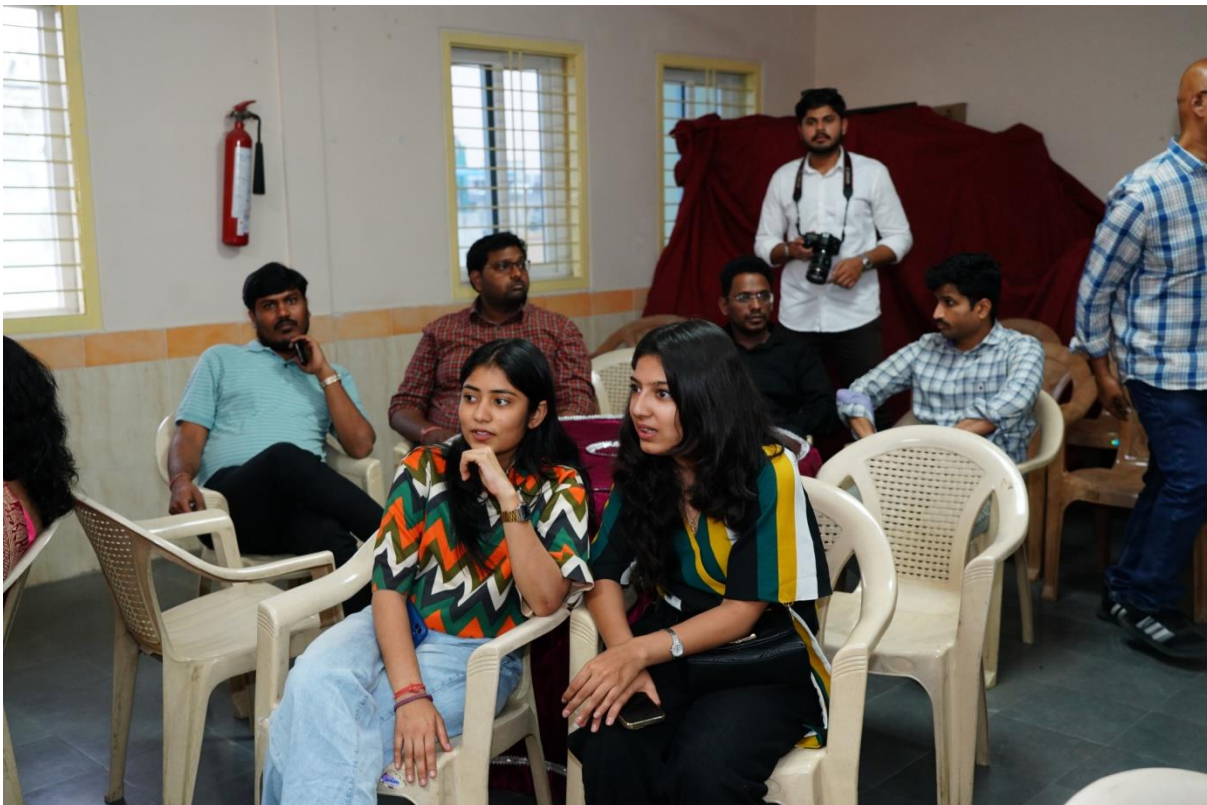
Alumni attending MILAN 2024