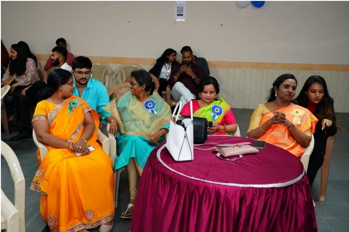
Alumni interacting with Faculty