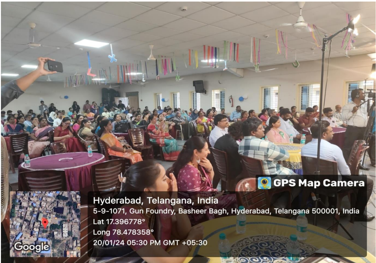
Faculty & Alumni attending MILAN 2024