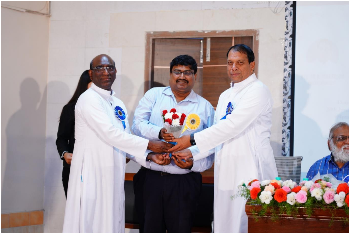
Welcoming Guest of Honour