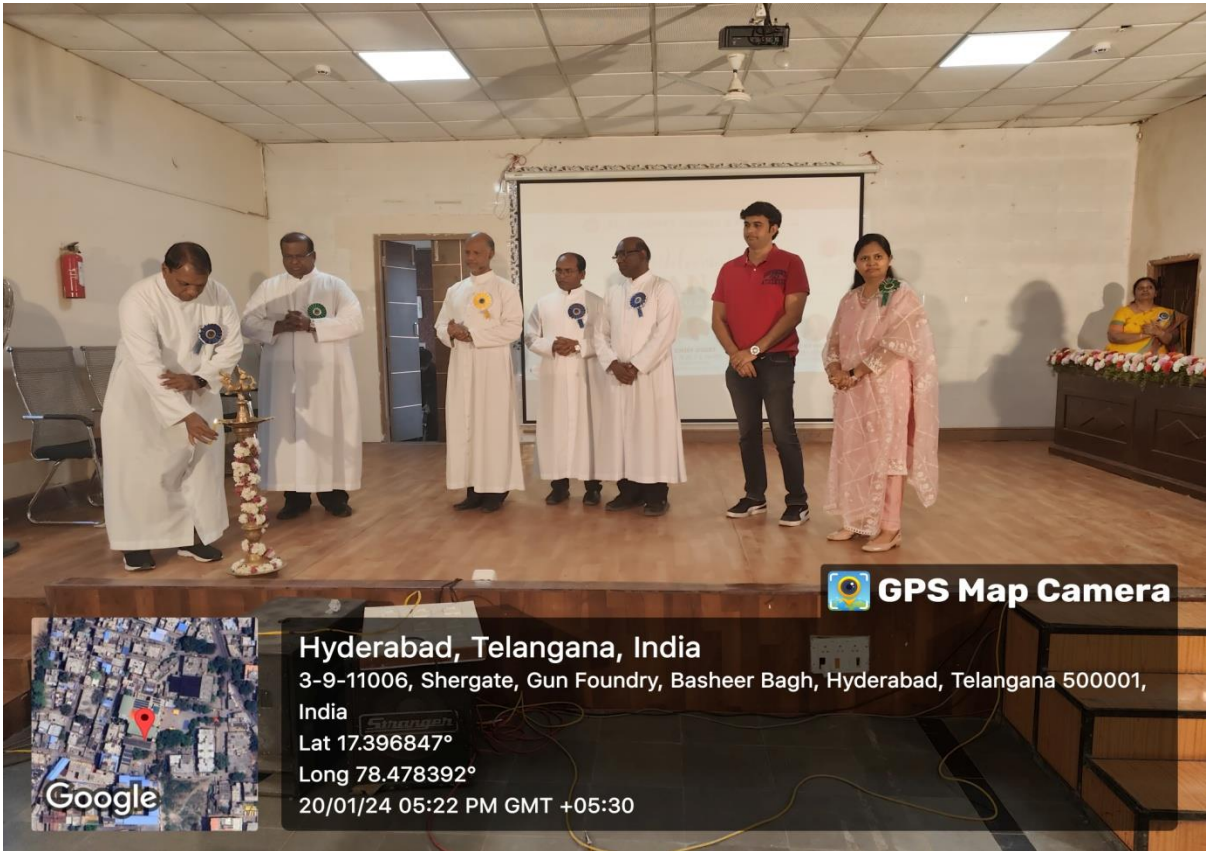
Lighting of the Lamp