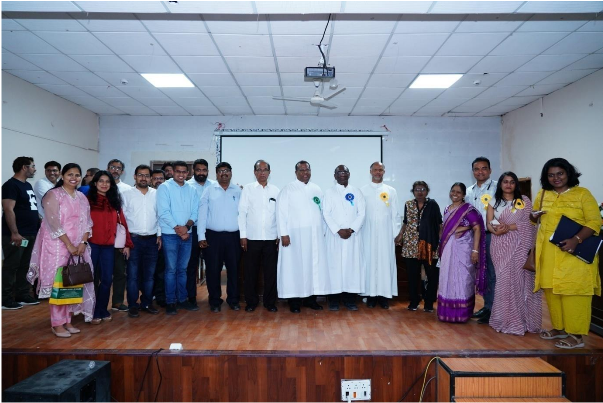
Alumni with Dignitaries