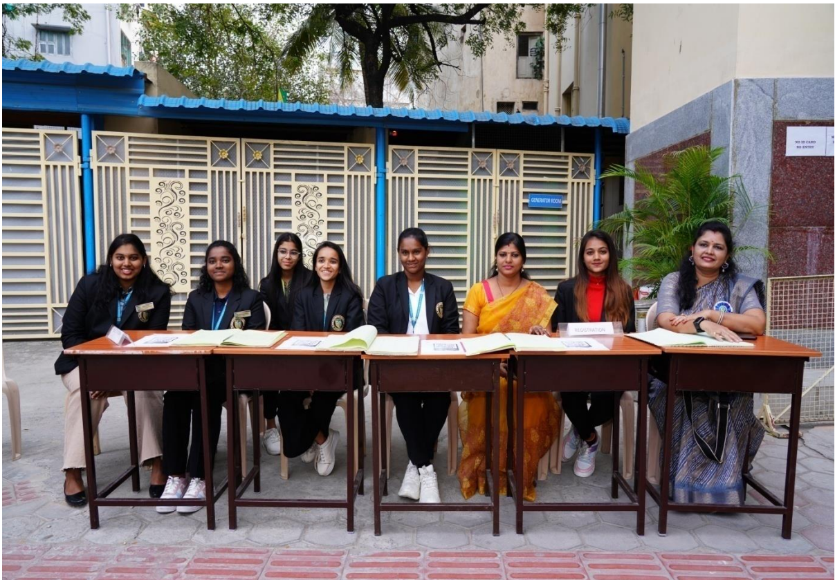
Alumni Registering for MILAN 2024