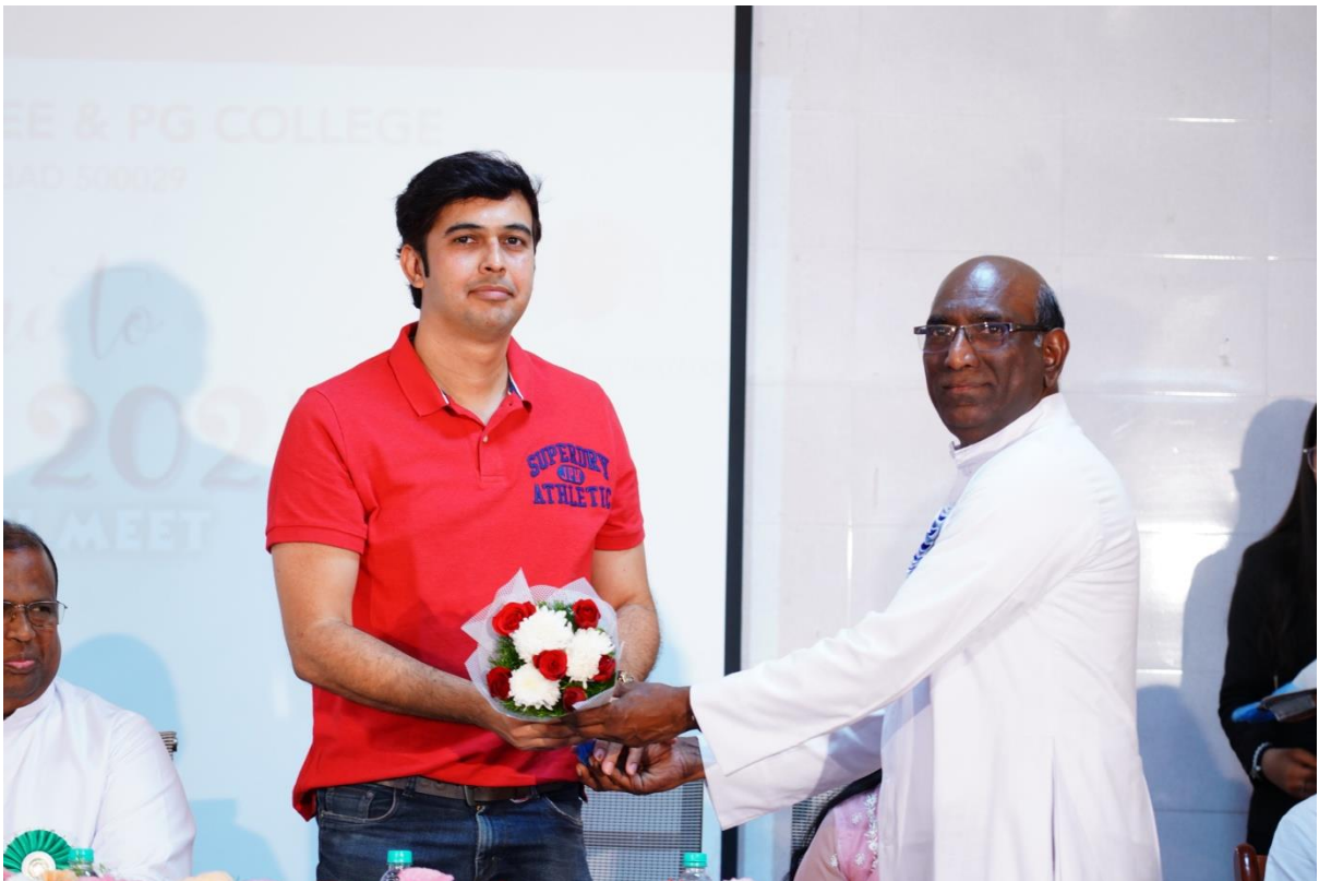
Welcoming Guest of Honour