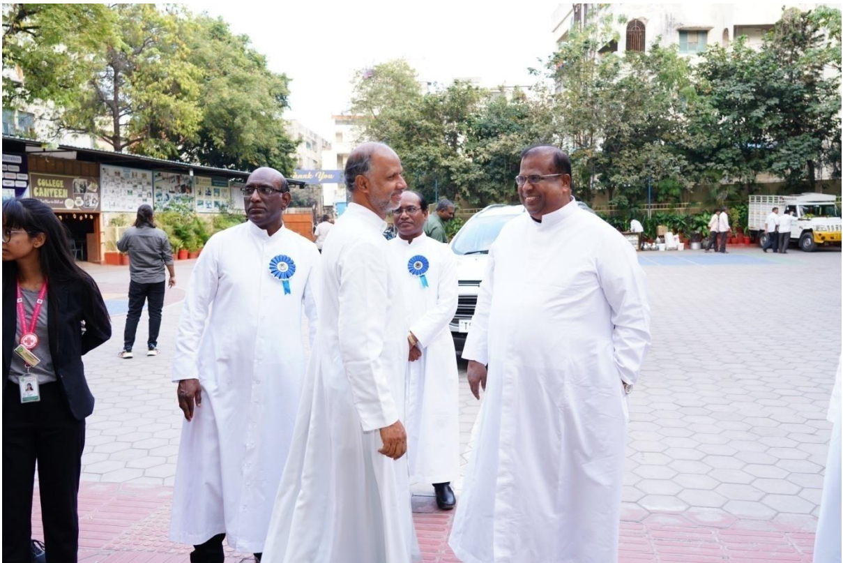
Welcoming of Dignitaries for “MILAN 2024”