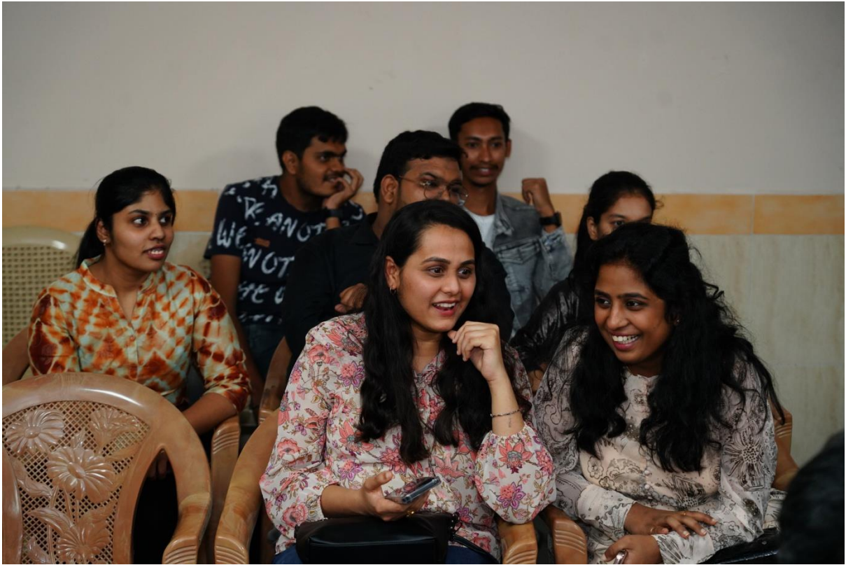
Alumni attending MILAN 2024