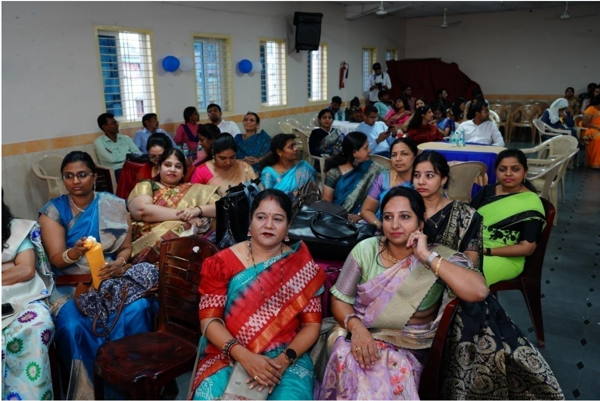
Faculty attending MILAN 2024