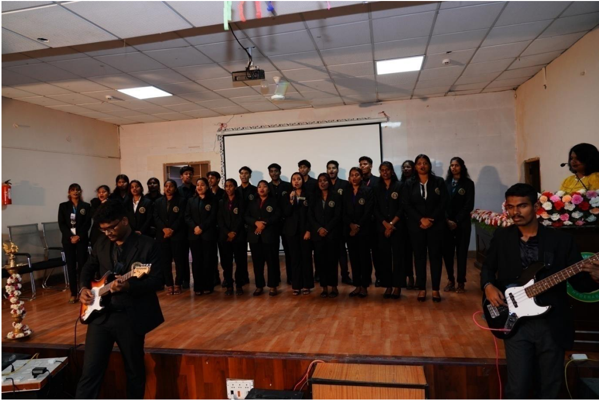
Prayer Song by College Choir "Anna Domini"