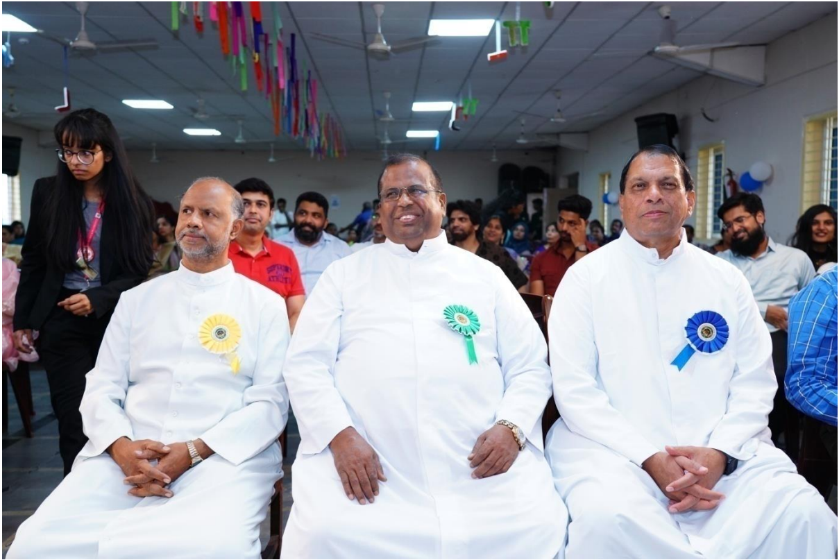
Dignitaries at MILAN 2024