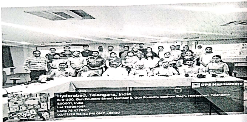
Operations Domain Industry Academia Meet – Experts from Industry and Academia