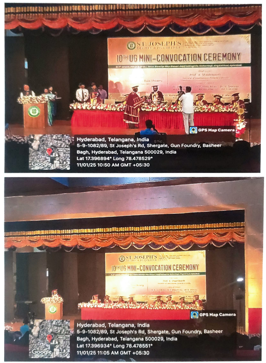
Guests addressing the students